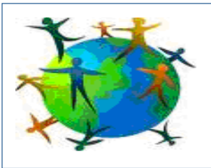
Cultural Competency Committee