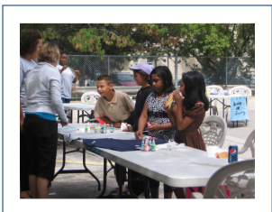
Storefront Charity Barbeque August 18, 2010